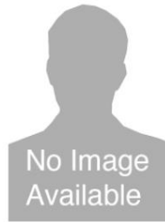
(OPEN) City of Circleville Term Exp 2024